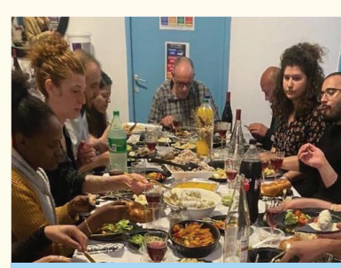
Our Staff and Youth Celebrating Together

The center provides assistance to youth and young people engaged in prostitution.