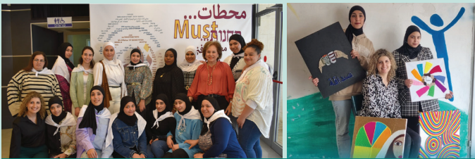
We Love Empowered Women!

We love giving youth a platform to express themselves and amplify their voices!