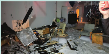
Galgal center before and after the fire

Galgal, ELEM’s shelter for young women and teenage girls in Jerusalem was burned down.