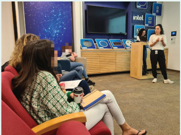
Our Young Mothers Receiving Training at Intel

As one participant said: "This was a taste of the future I could have."