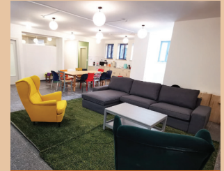
Our new Center in Jerusalem

Much like our program A Real Home for young women who experienced sexual abuse in their childhood, the center in Jerusalem is very welcoming and relies on the social interaction of a community in which the youth feel empowered by each other's presence.