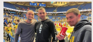
ELEM youth having a ball at the game!

Youth experiencing homelessness rarely get to enjoy fun outings that we all take for granted. Recently, three young men from our shelter, Someone to Run With , got to enjoy a basketball game between two of Israel's leading teams, Maccabi Tel Aviv and Galil Gilboa. Experiencing the excitement of the game was unforgettable for these youths. The smiles and joy in their eyes spoke louder than words. And sharing the experience with an ELEM staff member helped them all bond.