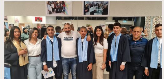
Officially high school grads

We are so proud of our incredible youth who deal with many difficulties, and we're in awe of our staff and volunteers at the centers who mentored the boys for years. What a success!