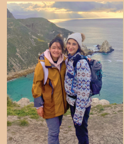
Celebrating a Beautiful Life Cut Short

Interested in becoming an ELEM Ambassador? Contact cdrachman@elem.org