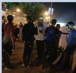
ELEM Staff at Mt. Meron in 2019

Last year, during what should have been a joyous Lag Ba'Omer celebration during the annual pilgrimage to Mt. Meron, 150 men and boys lost their lives, and 45 were injured in what is now known as Israel's deadliest civil disaster.