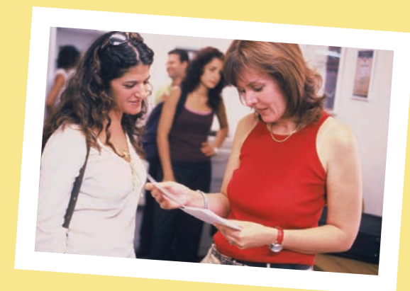
ELEM volunteer talks with teen

The project's aim was to promote ELEM's youth volunteering in the community with the idea that youth who are more involved in the community are less likely to be involved in dangerous and illegal activities. It is also believed that the teens can help other youth in distress in a unique way.