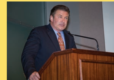
Alec Baldwin was the special guest at ELEM's 26th annual gala dinner

The evening raised $375,000 for ELEM's programs in Israel.